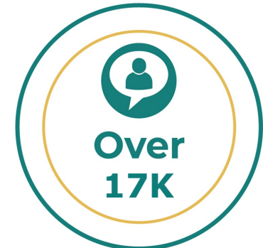
Clients in CRN