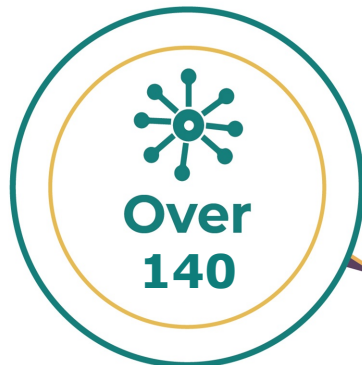
CRN Network Partners