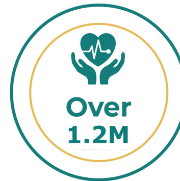
Total Lives Supported