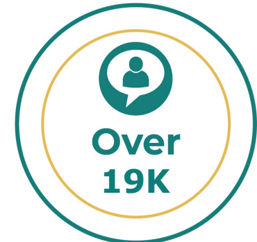
Clients in CRN