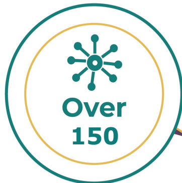
CRN Network Partners